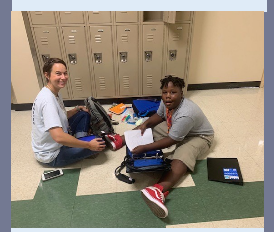
6th grade counselor helping a student with organization.