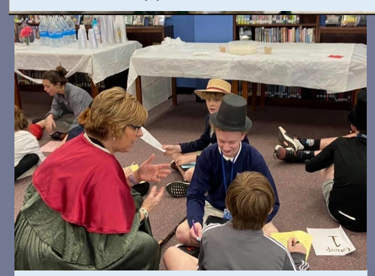
7th grade ELA teachers working with student s during a simulation activity.