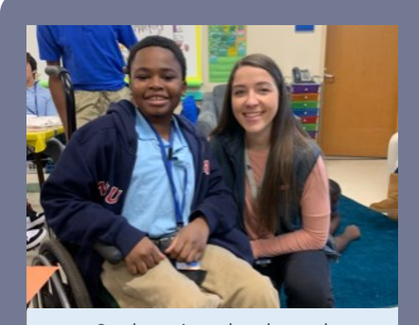
Students in a class hosted "Friendsgiving" to show their teachers appreciation.